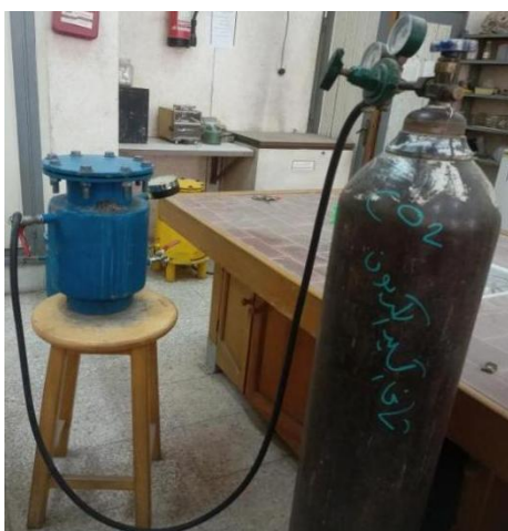
Figure 2. Metal chamber connected with gas cylinder.

to remove air from inside the chamber and then it was closed while the gas flow continued inside until the desired pressure level was reached. Three pressure levels (2, 4 and 6 kg/cm 2 ) were examined in the experiment. The exposure period for all stages of both insect species was two days. Once the exposure period was completed, the chamber was opened carefully and gradually. After each treatment, eggs, larvae, pupae and adults were transferred individually to 250 ml plastic jars that contained standard diets covered with muslin. These jars were kept at 27±1°C and 65±5% relative humidity until they were examined for mortality. Adult mortality was recorded 4-5 days after exposure. Larval mortality was observed for those larvae that had not metamorphosed into pupae 9 days after exposure, pupal mortality was counted for those pupae that had not emerged as adults after 9 days and egg hatch was recorded 7 days after treatment. The mortality data obtained from the treatments were adjusted using Abbott's formula (Abbott, 1925). Statistical analysis of the data obtained was conducted using the MSTAT statistical analysis package (MSTAT-C, 1991), following the methods described earlier (Gomez & Gomez, 1984). To test the differences between treatment means at a 5% level of probability, the least significant differences (LSD) method was applied, (Steel et al. , 1997).