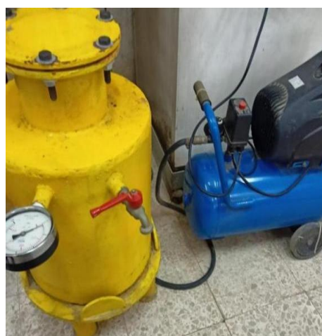
Figure 3. Metal chamber with air compressor.