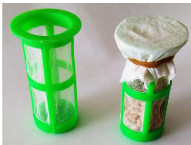
Figure 1. Wire gauze cages used for insect exposure to gases.

Adult stage- Recently hatched adult flies, around one week old, were divided into groups of 20 and moved away from the cultured population. They were then placed in designated vials containing an adequate amount of food.